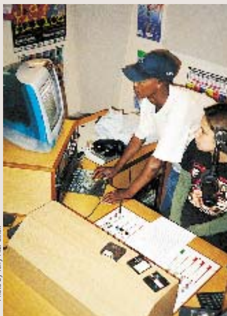
Bush Radio team prepares for newscast.

Bush dropped mid-day newscasts and added early morning news. The reporters now routinely monitor the BBC (they have rebroadcasting rights) and include BBC reports in their newscasts. The station now subscribes to NewsFlash, a wire service that provides South African and international news, so the local staff is free to cover local stories. The station's managers have instituted a daily budget meeting for story planning and persuaded the BBC to donate five minidisc field recording kits. They doubled the size of the news department and remodeled the newsroom. Now the station broadcasts six